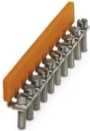
Fixed bridge, pitch: 8.2 mm, number of positions: 10, color: silver

Please be informed that the data shown in this PDF Document is generated from our Online Catalog. Please find the complete data in the user's documentation. Our General Terms of Use for Downloads are valid ( http://phoenixcontact.com/download )